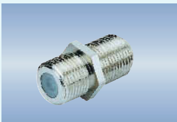
F-314 F FEMALE ADAPTER(F-81)