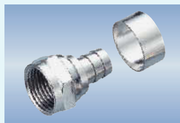
F-320 F CONNECTOR WITH RING (A) RG 58/U (B) RG 59/U (C) RG 6/U