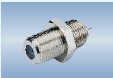
F-313 F BULKHEAD JACK RECEPTACLE (WATER PROOF)