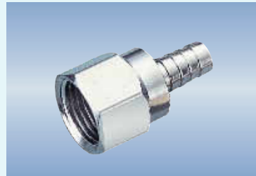
F-318 RG 59/U WITH RING