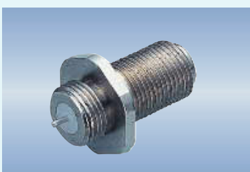
F-316 F BULKHEAD JACK RECEPTACLE (WATER PROOF)