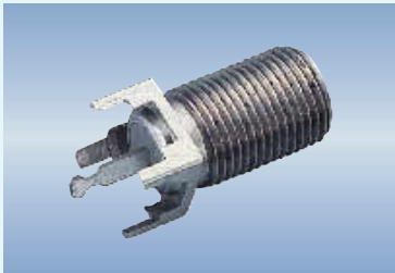
F-312 F FEMALE PC MOUNT