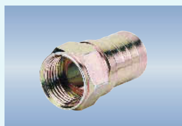
F-321 F CONNECTOR(RG 6/U)