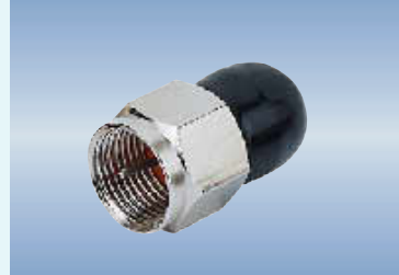
F-317 F MALE DUMMY LOAD 75 OHM