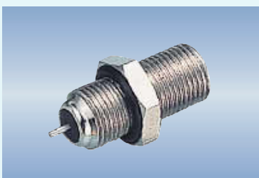
F-315 F BULKHEAD JACK RECEPTACLE (WATER PROOF)