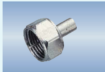
F-319 F MALE DUMMY LOAD 75 OHM