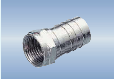
F-311 F CONNECTOR (RG 6/U)